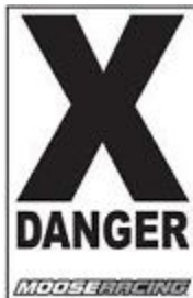
Take caution. i.e. downhill, ditch, etc.