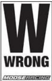
Wrong way. You missed a turn.